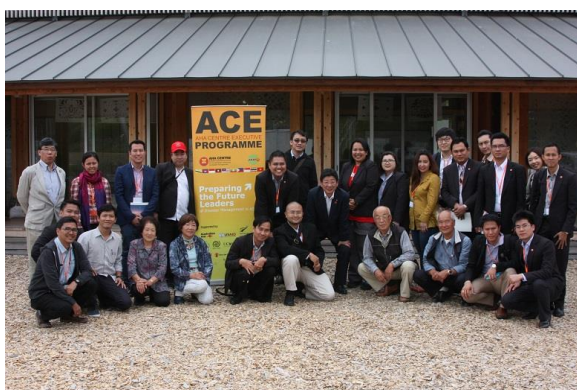
ACE Programme Officers in Minamisanriku Town