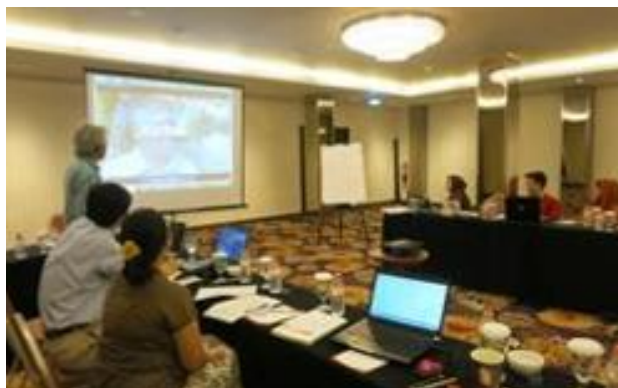
Launch of Indonesia MoFA project with PLANAS representatives in Jakarta