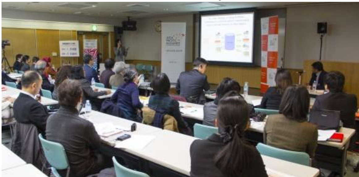
A-PAD's Public Forum event at the 3 rd UN World Conference on Disaster Risk Reduction

On March 14th A-PAD successfully hosted a Public Forum side event during the 3rd UN World Conference on Disaster Risk Reduction, which was held in Sendai, Japan. A-PAD's public forum entitled "The forefront of disaster response with private sector partnership: Innovations to achieve disaster risk reduction, response, and reconstruction beyond sectors and national borders" was held on the opening day of the WCDRR and was attended by more than 70 participants. A-PAD also set-up a Public Forum exhibition booth during the conference week from March 13 to 18 at the 5th floor of Sendai Mediatheque.