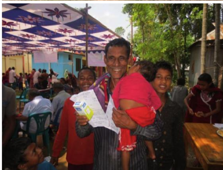
Top: The new school building constructed in Myanmar