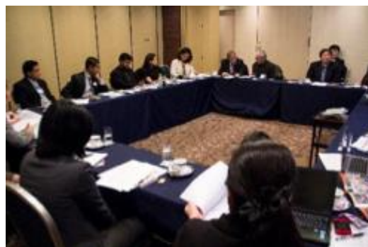
A-PAD General Assembly in Sendai, Japan in March

of A-PAD, bringing the total number of country members to six.