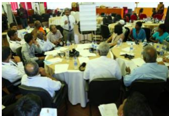
A-PAD Sri Lanka national platform networking meeting

The Bangladesh country project proposal is continuing to be developed by A-PAD MO and DCH Trust for submission during fiscal year 2015.