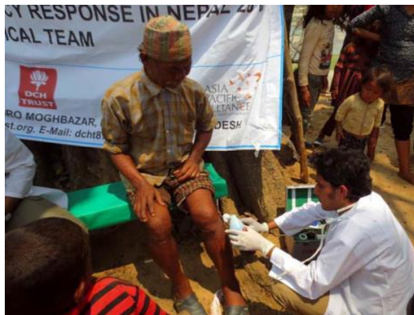
Top: A-PAD/PWJ joint team conducting search and rescue in Taiwan Bottom: Relief distribution to earthquake-affected communities in Nepal Left: DCH Medical Assistance Program in Nepal