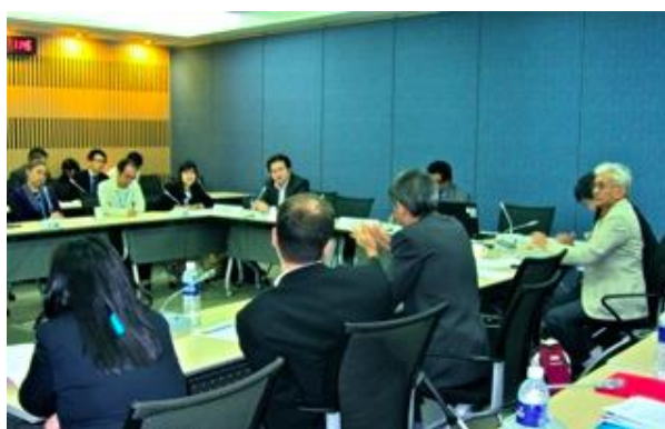
A-PAD at UNESCAP roundtable discussion