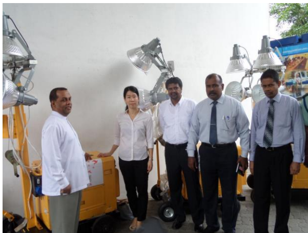
Top: A-PAD donates tarpaulins to typhoon-affected barangays Middle: Distribution of NFIs to Mayon volcano evacuees Bottom: Emergency Search Lights Donation in Sri Lanka

A-PAD Sri Lanka conducted a relief program for families affected by the Koslanda landslide. Utilizing A-PAD emergency funds of 30,000 USD and donations from more than 20 local member companies, A-PAD Sri Lanka donated emergency search lights and distributed food and non-food items.