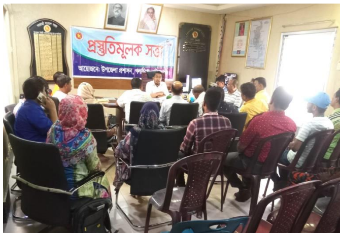
Disaster (Cyclone) Preparedness Meeting