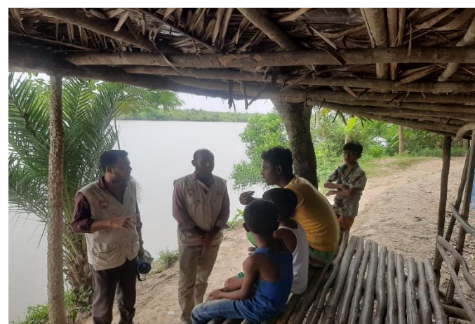
Community Focal Group Discussion for Cyclone Preparedness