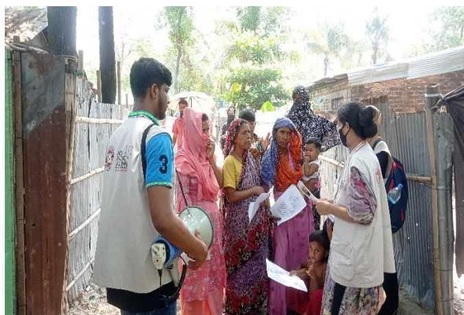
Community Awareness for CYCLONE MOCHA