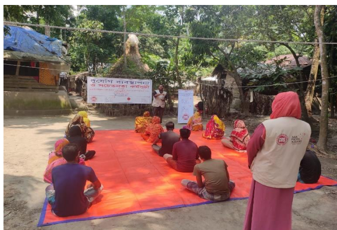
Community Meeting for Awareness