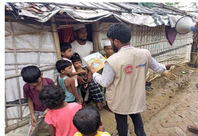
Rohingya Refugee Community Awareness by CIS