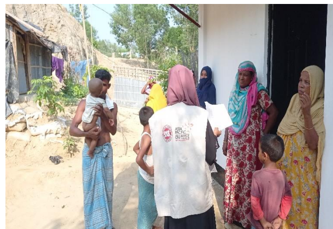
Cyclone Awareness Leaflet Distribution