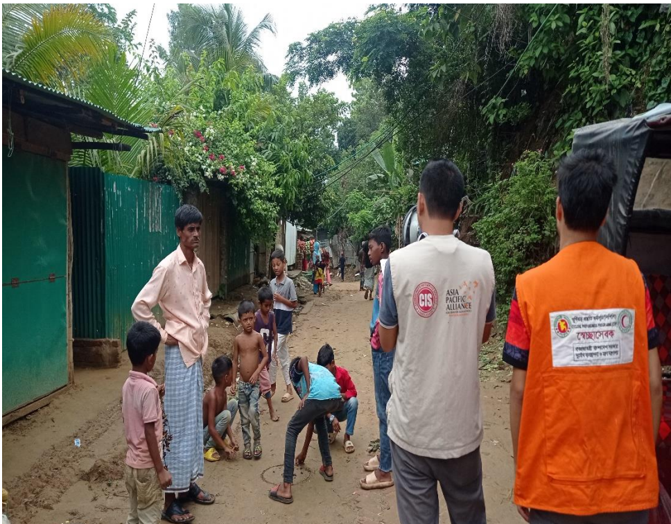
MIKING IN COMMUNITY HOUSEHOLDS FOR CYCLONE MOCHA AWARENESS