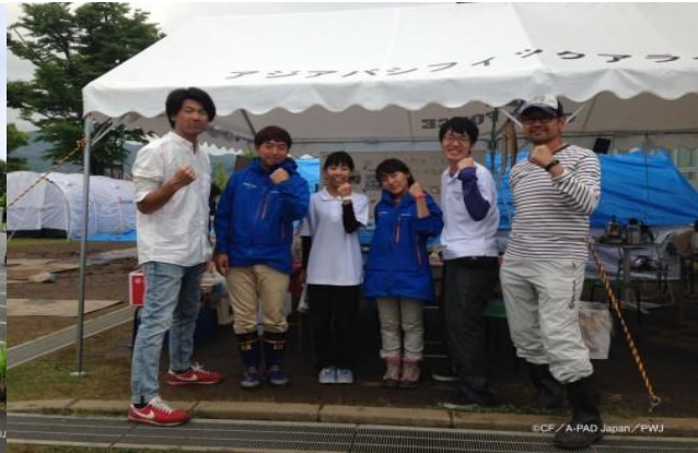
Volunteers in Kumamoto operation