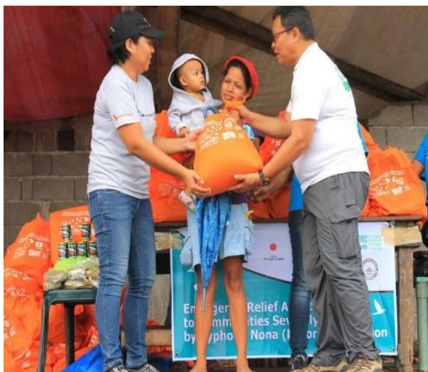
A-PAD Philippines staffs distributing relief items

Typhoon Lando (International name Koppu) that made landfall at Casiguran in Luzon Island on October 18 was the worst storm to hit the Philippines in 2015. A-PAD pre-positioned items including plastic container for water and tarpaulin were distributed together with procured foods (rice and canned foods). The 1,000 hygiene kits were donated through PDRF network and