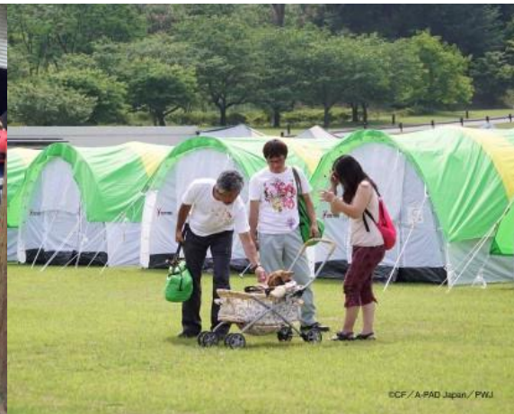
Tent village in Mashikimachi