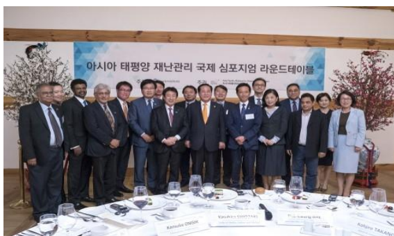
A-PAD and parliament members from Japan and Korea

A-PAD Korea/MO hosted two symposiums in Seoul: “HOW TO SAVE LIVES: The Cooperation beyond borders and sectors” (sponsored by Sasakawa Peace Foundation) on October 22, and “International Symposium on Disaster Management in the Asia Pacific Region” (co-hosted by National Diet Social Contribution Forum) on the following day. On October 22, the inauguration of “Korean National Platform,” which is a mechanism to enhance cooperation among the NGO, business, and public sectors, was declared. A-PAD also organized “the preparation roundtable to establish diet member forum” to enhance cross-border collaboration in a disaster, inviting Mr. Yasuhisa Shiozaki, the Minister of Health, Labor and Welfare.