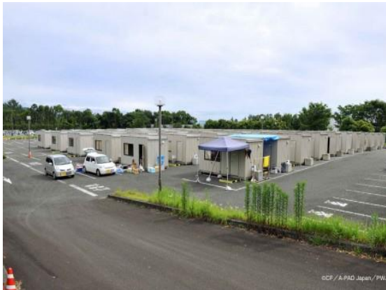
Unit houses in Mashikimachi