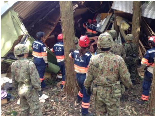
Search and rescue operation

Asia Pacific Alliance for Disaster Management (A-PAD) Japan, Peace Winds Japan (PWJ) and Civic Force have jointly been working in Kumamoto area immediately after the earthquake in April 2016. At first, search and rescue team was dispatched with rescue dog Yumenosuke and searched for survivors under collapsed houses in the two most seriously affected areas, the town of Mashiki and the village of Minamiaso. The joint team has also set up an inflatable shelter (Balloon Shelter) in affected town of Mashiki. Having shifted to emergency tent village operation for the families with pets, the team constructed unit house to provide safer and more comfortable living space. To make this unit house comfortable, team set up café and community place. Team will continue support people as the recovery may not be completed in short time.