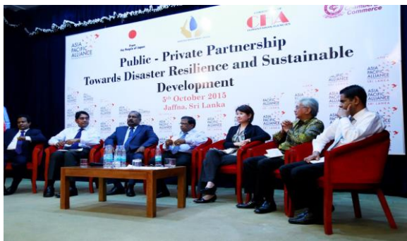
A-PAD Sri Lanka hosting symposium on October 5

On October 5, A-PAD Sri Lanka hosted an international symposium titled “Public-Private Partnership Towards Disaster Resilience and Sustainable Development” in Jaffna. About 180 participants from seven Asian countries and from multiple sectors such as NGO, business, and government attended it, discussing how to share and utilize knowledge and experience of each country. The symposium attracted attentions in Sri Lanka, as four national newspapers reported about it.