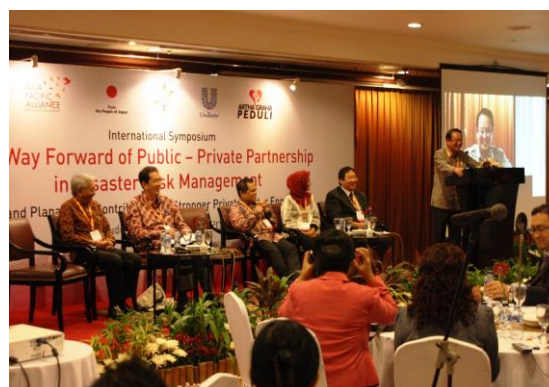
A-PAD Indonesia hosting symposium

A-PAD and Indonesian National Platform for Disaster Risk Reduction (PLANAS) jointly hosted international symposium on January 19. With its title “The Way Forward: Public-Private Partnerships in Disaster Risk Management”, the main focus of the symposium is to address the role of private sector in disaster management and to share the best practices of the private sector’s involvement in the area and of public-private cooperation in building community disaster resilience.