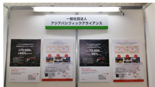
A-PAD's booth in forum on March 12

A-PAD participated in Sendai Disaster Preparedness forum 2016 (hosted by Government of Sendai) on March 12. In this forum, A-PAD arranged desk to introduce each member country and their projects with emergency relief project A-PAD have been participated. A-PAD also shared ideas with many stakeholders participated in the forum.