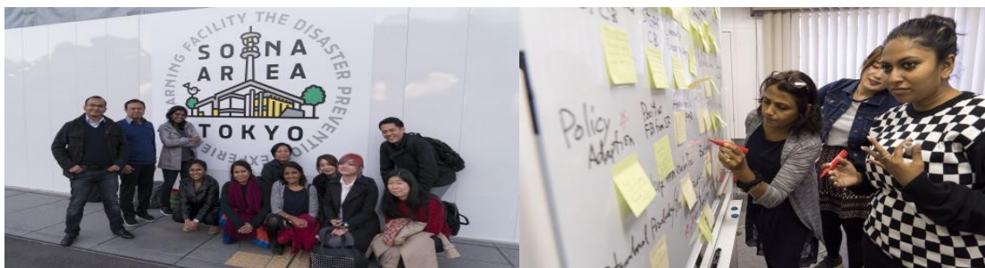
A-PAD international staff during training in Tokyo

9 international staff members of A-PAD national platform from Bangladesh, Philippines, Indonesia, Sri Lanka, Korea participated international staff training in Tokyo for 4 days. This training aims to share best practice of mutual collaboration in disaster management and enhance mutual understanding and collaboration between A-PAD national platforms.