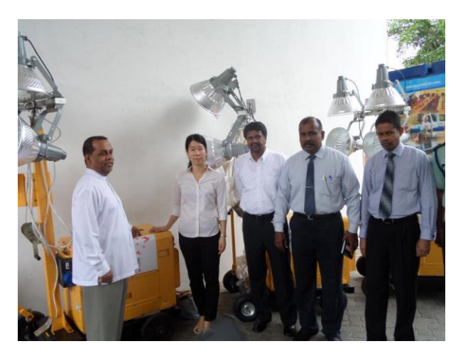
Top: A-PAD donates tarpaulins to typhoon-affected barangays Middle: Distribution of NFIs to Mayon volcano evacuees Bottom: Emergency Search Lights Donation in SriLanka