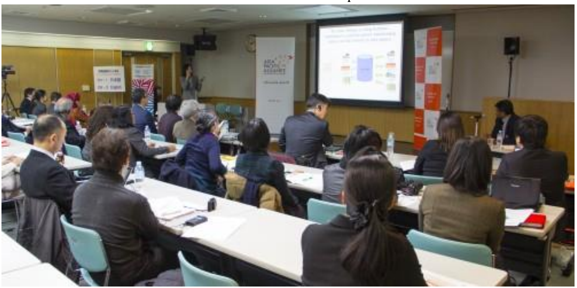
A-PAD's Public Forum event at the 3^{\rm rd} UN World Conference on Disaster Risk Reduction

On March 14th A-PAD successfully hosted a Public Forum side event during the 3rd UN World Conference on Disaster Risk Reduction, which was held in Sendai, Japan. A-PAD's public forum entitled "The forefront of disaster response with private sector partnership: Innovations to achieve disaster risk reduction, response, and reconstruction beyond sectors and national borders" was held on the opening day of the WCDRR and was attended by more than 70 participants. A-PAD also set-up a Public Forum exhibition booth during the conference week from March 13 to 18 at the 5th floor of Sendai Mediatheque.