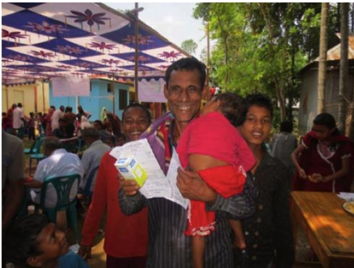
Top: The new school building constructed in Myanmar Bottom: Residents in Teghoria receive healthcare at local clinic set up by DCH Trust