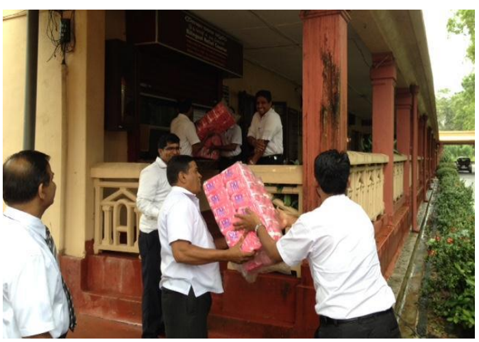
Top: A-PAD/PWJ joint search and rescue team predeployed before Hagupit Middle: A-PAD Sri Lanka supports communities affected by water contamination Bottom: A-PAD Sri Lanka distributes emergency relief